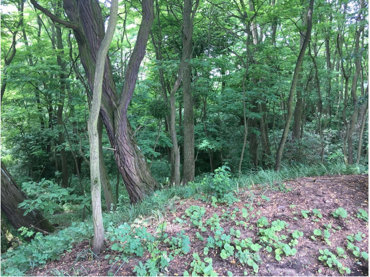
The southern edge of the cemetery looking downhill into the forest.