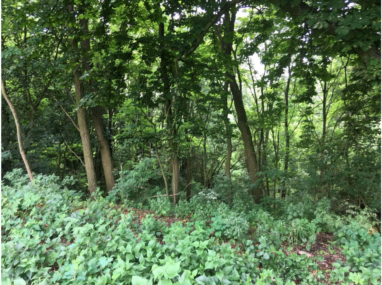
Another view to the south of the cemetery grounds. In this direction the Przechowka villagers' fields would have stretched out towards the Vistula but today it's thick forest.