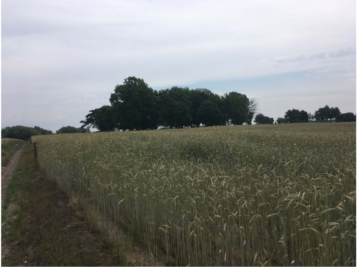
The cemetery at Jeziorki is located northeast from the main village road among the farmers' fields. The large trees in this photo mark the cemetery ( 53^{\circ}28'55.4''\text{N} 18^{\circ}11'25.3''\text{E} )