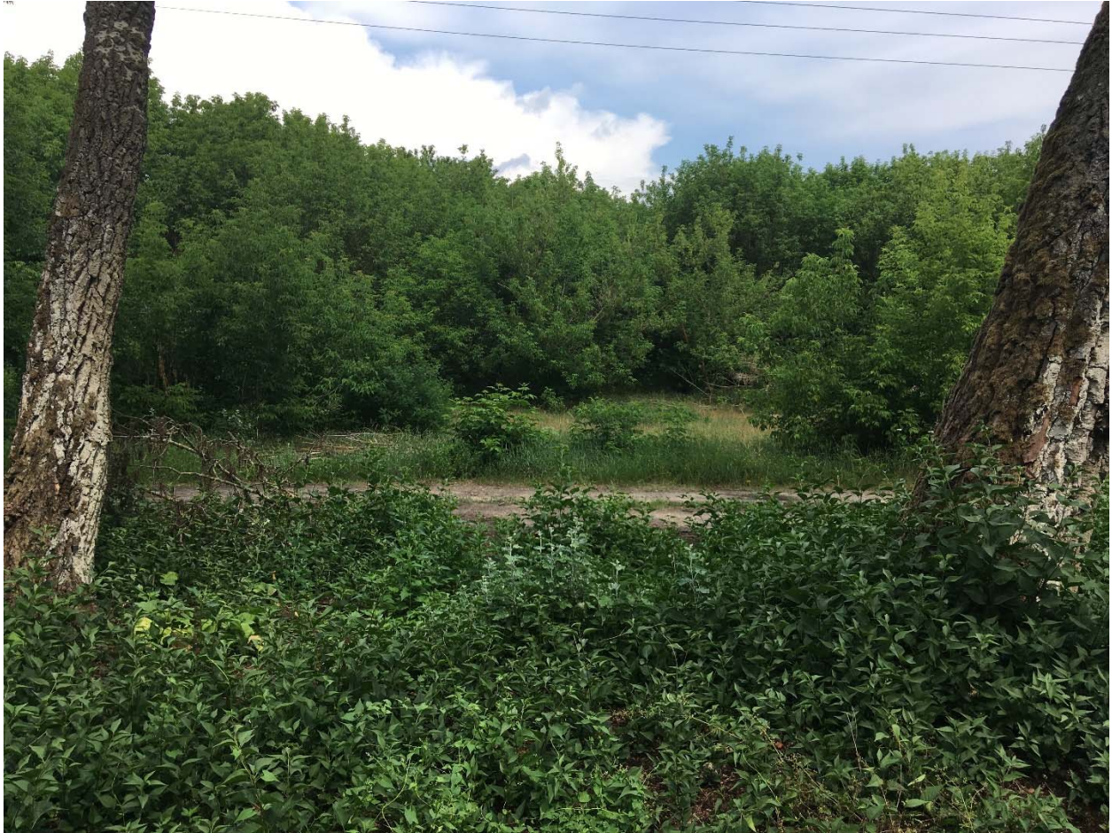
View to the north from the cemetery towards the road and the forest between cemetery and Mondi factory.