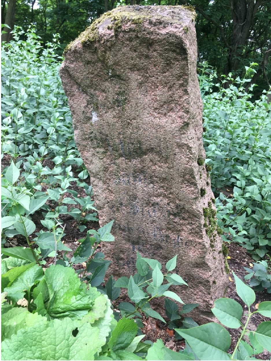
This stone has words painted on it instead of inscribed into it but nothing legible.