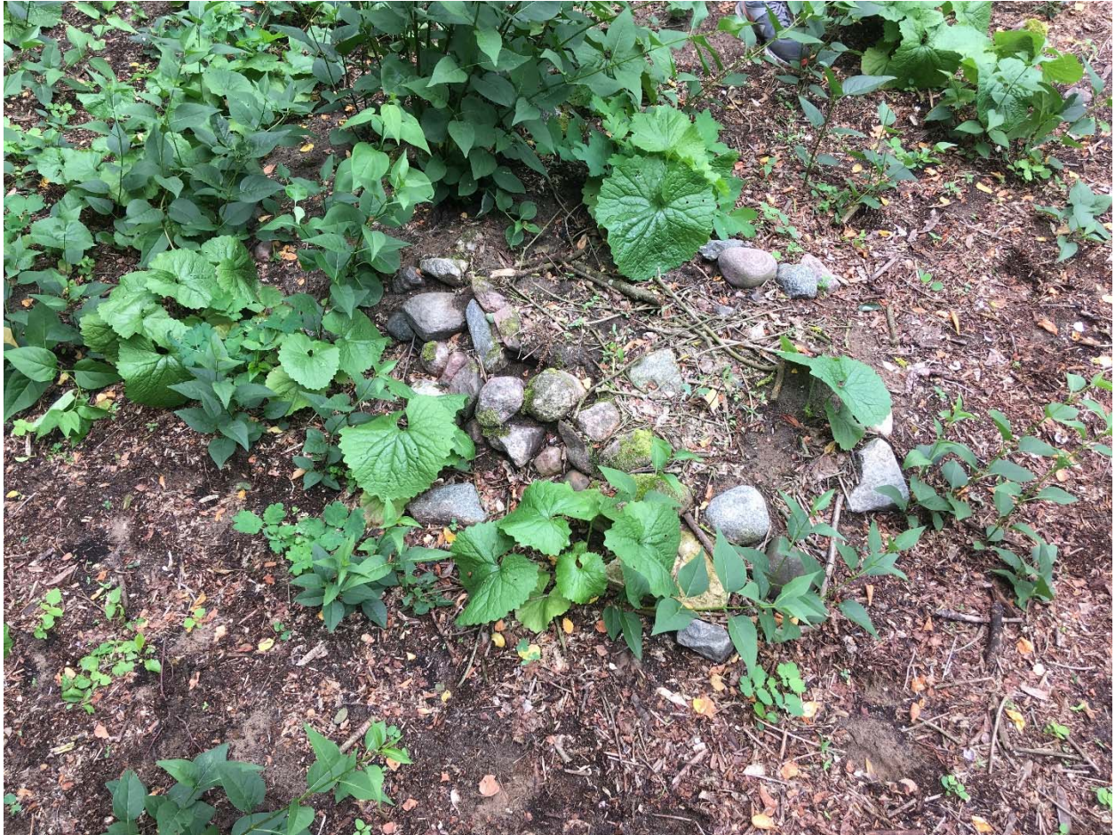
And here is another, clearly oval-shaped, collection of smaller stones marking a poor person's grave.