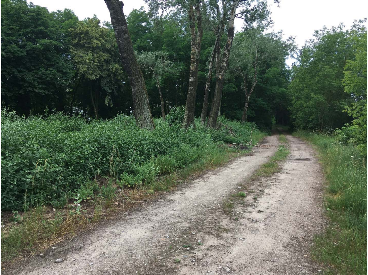
View up the Przechowka road looking almost due west towards Konopat with the cemetery on the left (south).