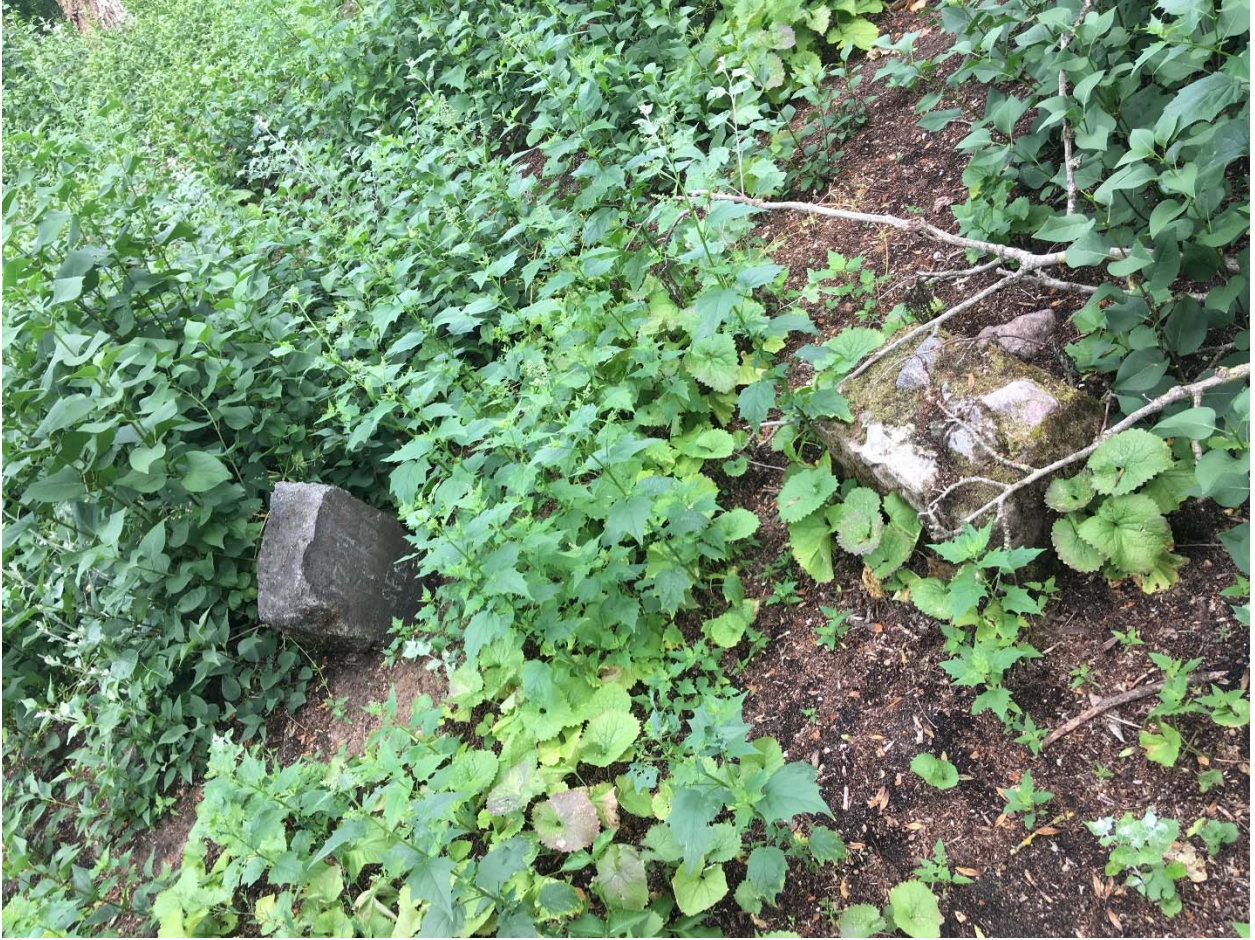
The stone here to the left seems to indicate a date in the 1750s (perhaps it says 1751).