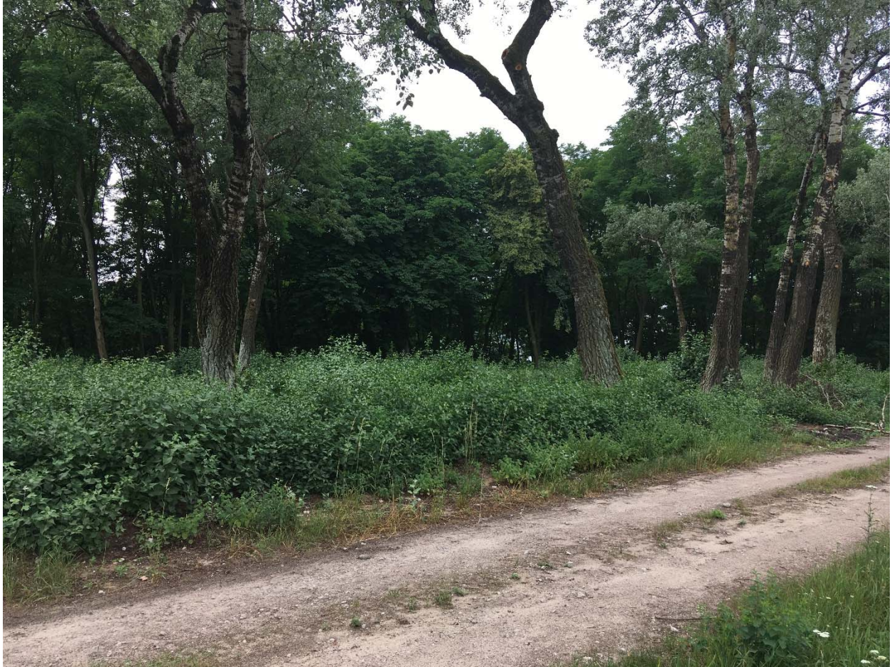
View of the cemetery looking to the southwest with the main village road in the foreground. The ground of the cemetery is covered in small lilac bushes and Michal Targowsky says the cemetery is maintained by folks from the Mennonite cottage in nearby Chrystkowo.