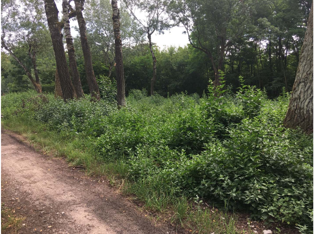
A view looking more toward the west along the main road toward the area where the 1906 map indicates the schoolhouse. Could the school and meetinghouse have stood in this direction?